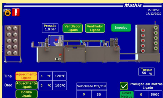
Touch Screen controller Option to activate half of up-winders only

* Material for rollers/cylinders defined on demand