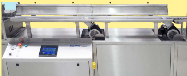
Dryer channel, panel with Touch Screen controller

Customized machine designs according to customer needs, pilot or productions lines. On request