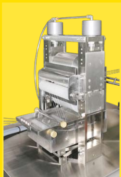
impregnation padder with heated trough