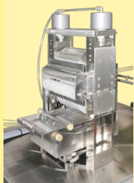
impregnation padder with heated immersion trough

Dryer options: hot air ventilation channel, or dryer drums